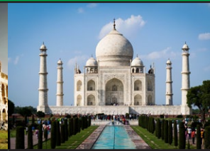
Taj Mahal, India