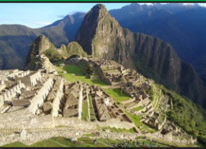
Machu Picchu, Peru