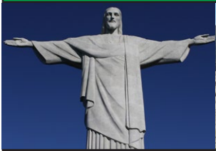
Christ the Redeemer, Brazil