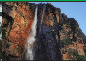
Angel Falls, Venezuela