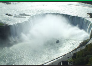
Niagara Falls, Ontario/New York