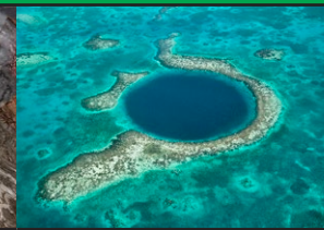
Great Blue Hole, Belize