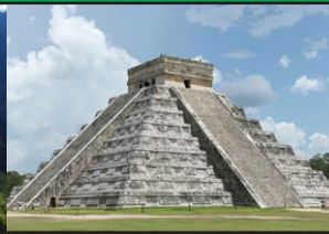
Chichen Itza, Mexico