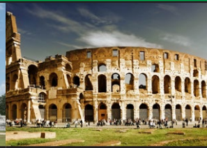
The Colosseum, Italy