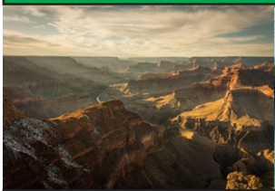
Grand Canyon, Arizona