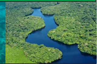
Amazon Rainforest, Brazil