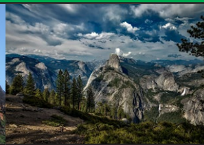
Yosemite Valley, California