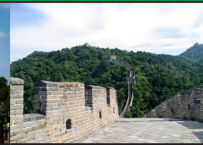
The Great Wall of China